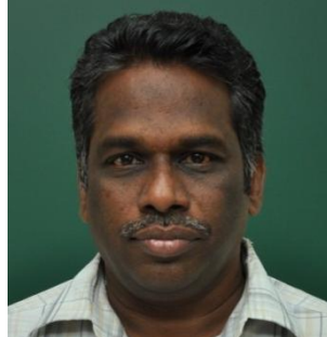
Prof. K. Anbazhagan